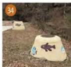
Fish of Bentonville Yenui Wickramasinghe