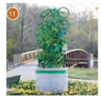
Green Bike Tower Tylur French