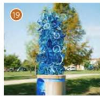
Blue Bike Tower Tylur French