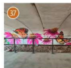
Flowers