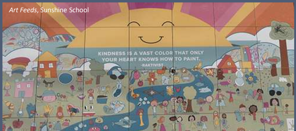
Art Feeds, Sunshine School