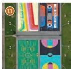
Basketball Courts Ignite Students