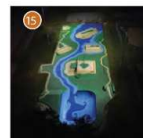
Natural Skate The Mars Agency