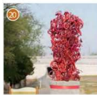
Red Bike Tower Tylur French