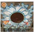
New Growth Napoleon Dezaldivar