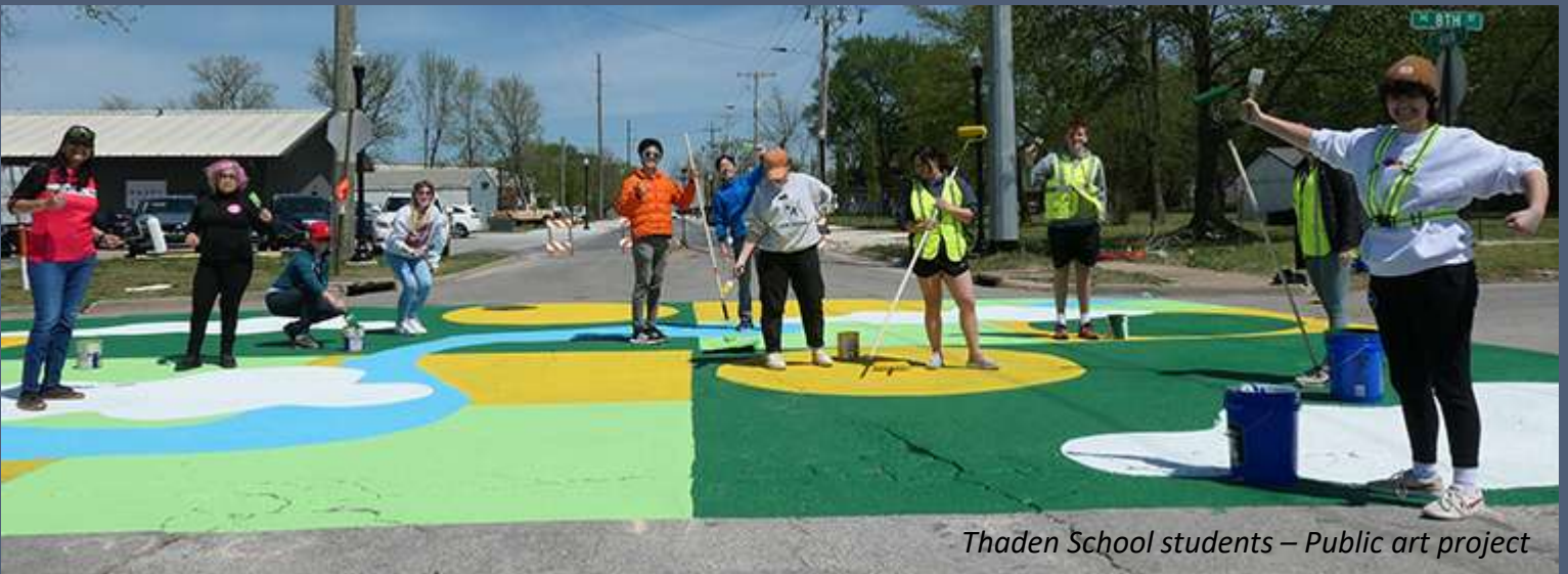
Thaden School students – Public art project