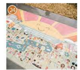
Art Feeds Sunshine School Students