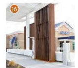
Arvest Bike Pavilion High-Jackson