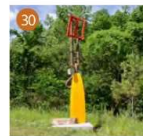
Double Slit Skyline Dewane Hughes