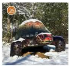
Box Turtle Stephen Feilbach