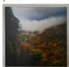
Hawksbill Crag