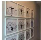
Double Dutch Robin Rhode