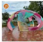
Bubble Hou de Sousa