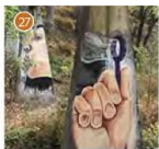
ColorFULL Sugar Creek Elementary Art Club